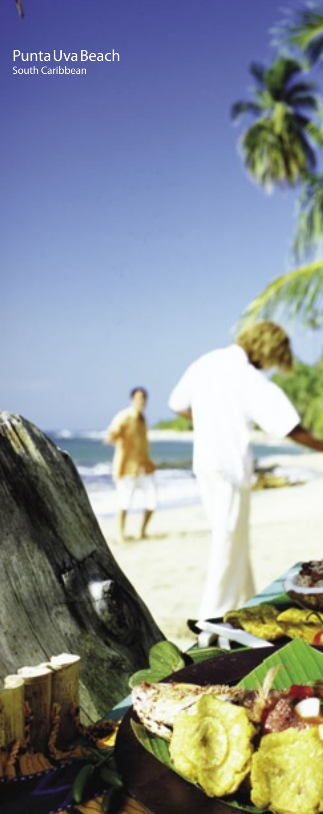
Punta Uva Beach South Caribbean